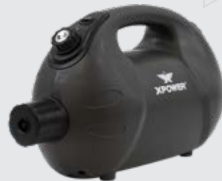
FDS STANDARD RECHARGEABLE (F-16B)