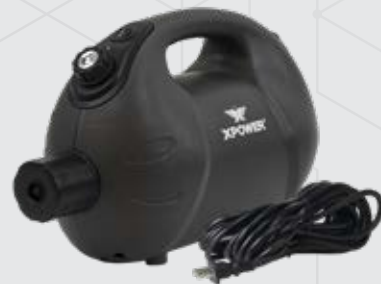
FDS STANDARD (F-16)

True to its name, a ULV cold fogger creates ultra-low volume droplets less than 50 microns in size, distributed evenly over the entire treated area ensuring optimal effectiveness. Combining a nozzle capable of creating ultrafine droplets with a powerful motor, droplets will be widely dispersed, staying suspended in the air long enough for complete disinfection to occur. This light mist is a temporary coating that disinfects surfaces before quickly evaporating. Smaller droplets allow a more complete disinfecting job with far less solution, while facilitating faster dry times. Even better, you don't need to aim the fog at surfaces, as it will expand to fill the entire space and target all surfaces automatically.