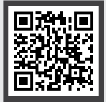
Warranty Registration Page