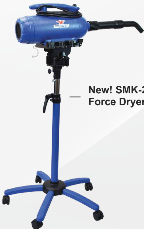
New! SMK-2 Force Dryer Stand