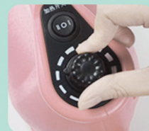
Plug in power and power on