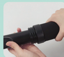
Choose and connect the nozzle