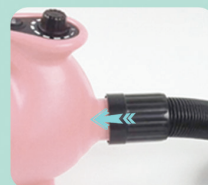
Connect the hose