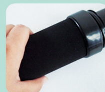
Connect the heat-proof hand grip