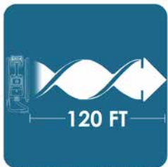
External roto-motor and front grill design creates focused air flow that travels up to 120ft