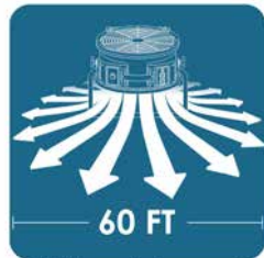
Point it downward to dry area around the fan up to 60 ft in diameter