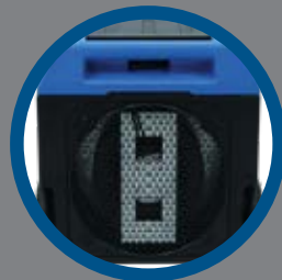
Rolling wheels for easy transportation