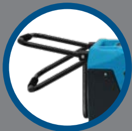
Rigid Handle Design