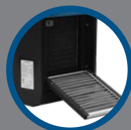
Stainless Steel Filter