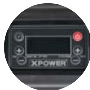
Digital Screen & 5 Speed