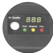
PM2.5 Air Quality Sensor