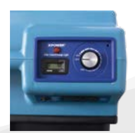
Speed & Hour Meter (X-4700AM)