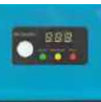
PM2.5 Air Quality Display Panel