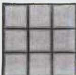
NFS13 WASHABLE NYLON MESH FILTER