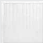
HEPA65-33 HEPA FILTER

FILTER CHANGE LIGHT Indicates when filter needs to be cleaned or changed.