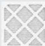
PF13 PLEATED MEDIA FILTER