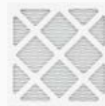
PF16 PLEATED MEDIA FILTER