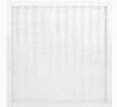
HEPA50 HEPA FILTER