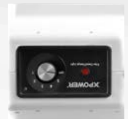
5 Speed Control Panel