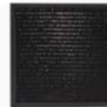
CF35 ACTIVE CARBON FILTER