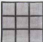
NFS13 WASHABLE NYLON MESH FILTER