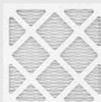
PF13 PLEATED MEDIA FILTER