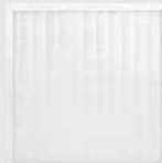
HEPA65-33 HEPA FILTER

FILTER CHANGE LIGHT Indicates when filter needs to be cleaned or changed.