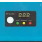
PM2.5 Air Quality Display Panel