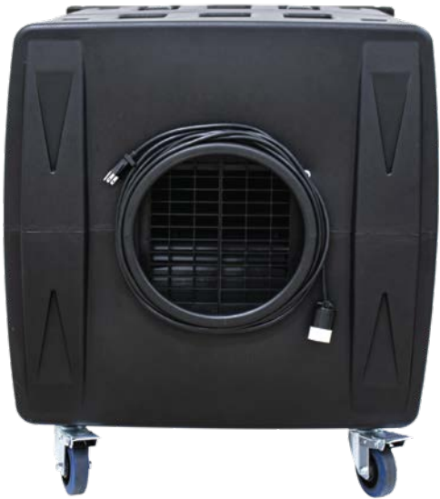
12" Exhaust Collar