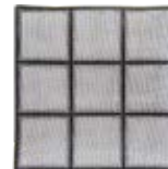
WASHABLE NYLON MESH FILTER (Captures visible and large particulates)