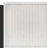
HEPA FILTER (99.97% Filtration Efficiency Of Particulates 0.3 Microns Or Larger)