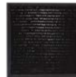
ACTIVE CARBON FILTER (Captures odor, contaminants and VOC's)