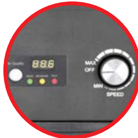
PM2.5 Air Quality Sensor & Variable speed