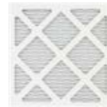
PLEATED MEDIA FILTER (Captures dust and medium particulates)