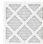
PLEATED MEDIA FILTER (Captures dust and medium particulates)