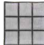
WASHABLE NYLON MESH FILTER (Captures visible and large particulates)