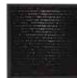
ACTIVE CARBON FILTER (Captures odor, contaminants and VOC's)