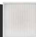
HEPA FILTER (99.97% Filtration Efficiency Of Particulates 0.3 Microns Or Larger)